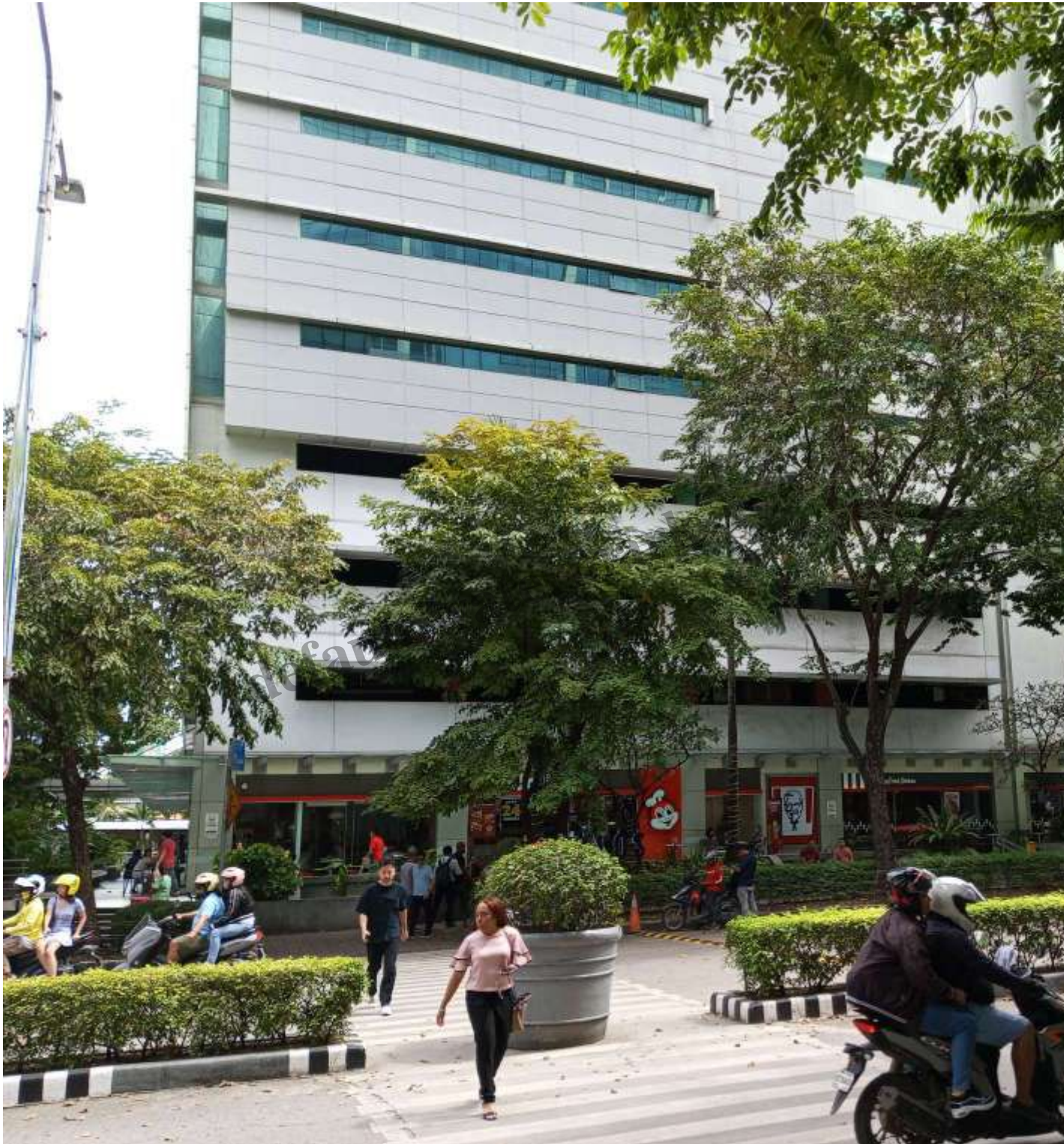
The ground floor of i3 and i2 building with Jollibee, KFC, and Orange Brutus side by side.

There are cheaper options just outside in the corners of Cebu IT Park which are street food vendors and carinderias. For those who don't know what a Carinderia is, it's like fast food but the menu are mostly Filipino home-cooked meals and they are a lot cheaper which is a go-to choice for employees who are still entry-level salaries.