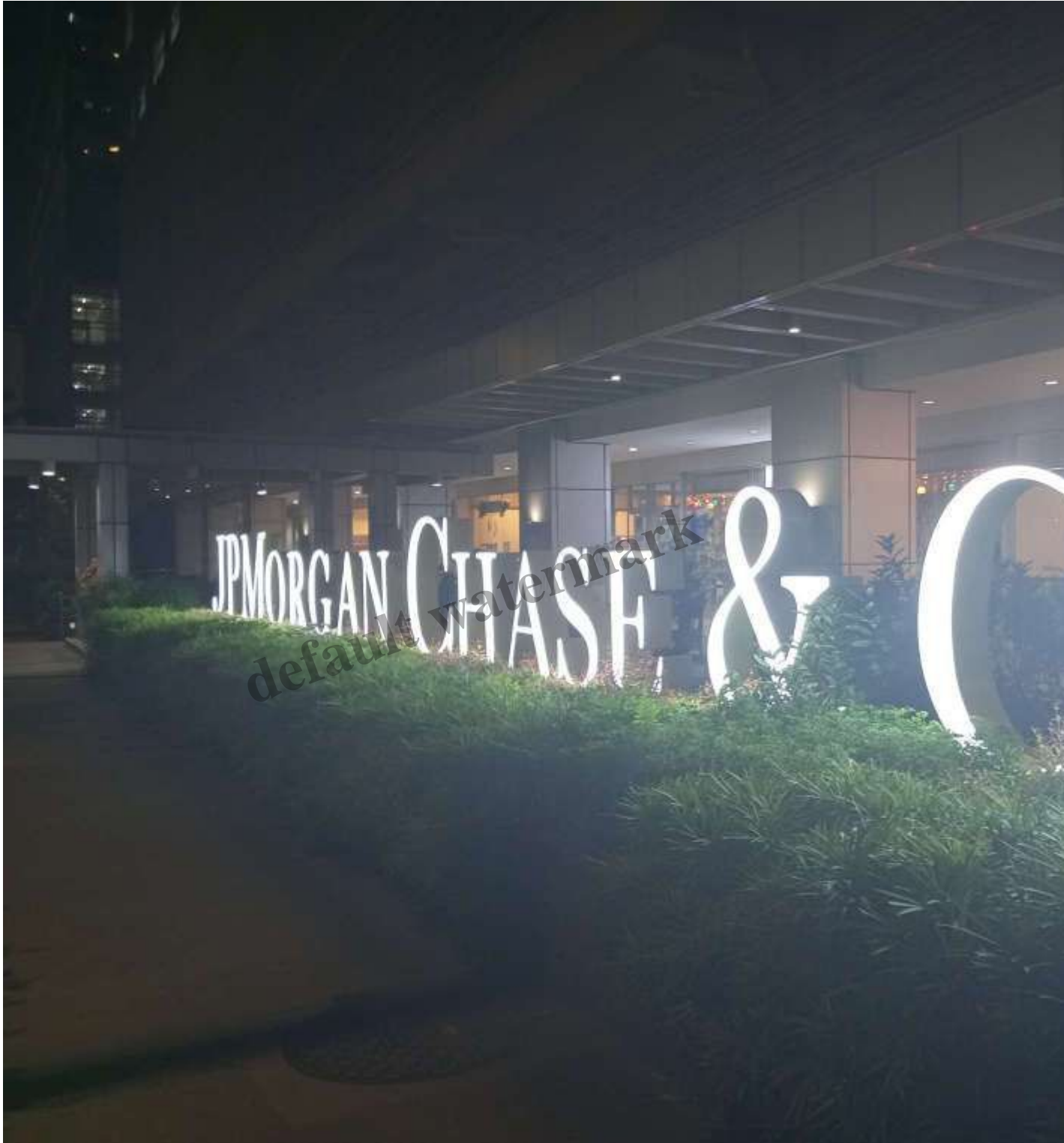
JPMorgan Chase & Co. logo LED signage outside of eBloc Tower 1. Took this photo at night after work.